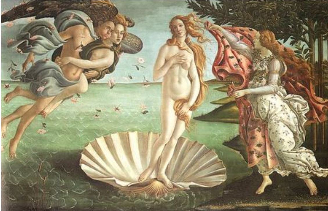
Sandro Botticelli (1482-1486), Uffizi Gallery, Florence, Italy

Finally we are in July and for most of you this is the best time for sailing! But even if you were to sail the Mediterranean it would be difficult for you to meet Aphrodite!!